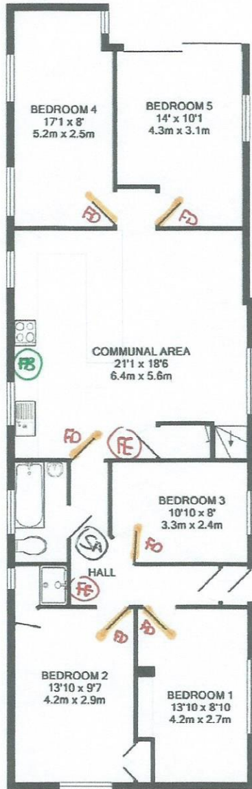
GROUND FLOOR APPROX. FLOOR AREA 1067 SQ.FT. (99.1 SQ.M.)