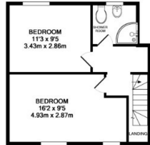
2ND FLOOR APPROX. FLOOR AREA 350 SQ.FT. (32.5 SQ.M.)